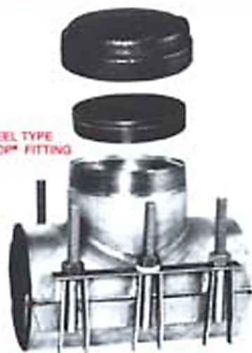
4", 6" and 8" HYDRA-STOP® FITTINGS