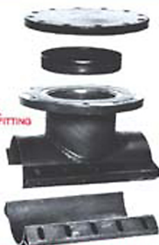
10" THROUGH 20" HYDRA-STOP® FITTINGS